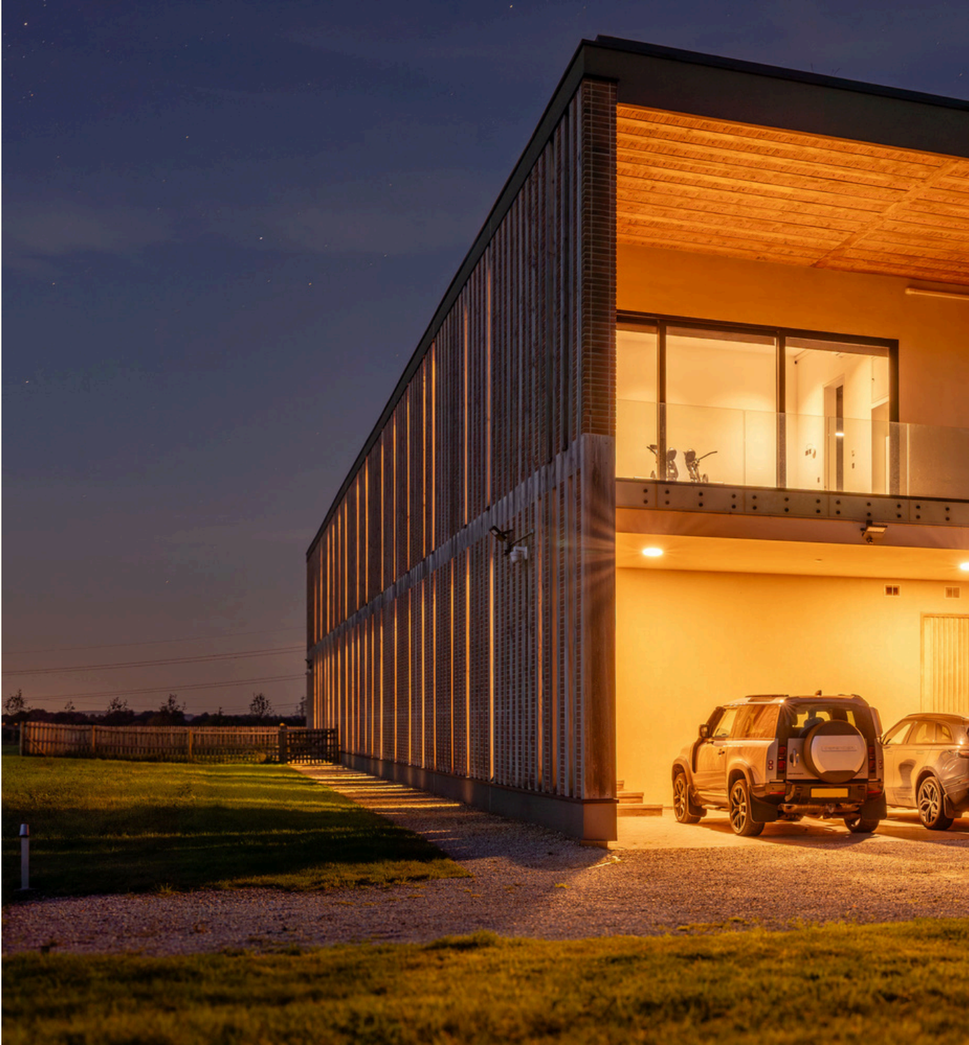
EVENING | HEDGE HOUSE | SOLD