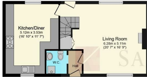
Ground Floor Floor area 52.4 m 2 (564 sq.ft.)