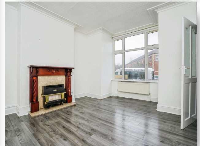
Shepherds Lane, LEEDS LS8 5AT