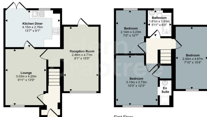
Ground Floor Approx 43 sq m / 463 sq ft