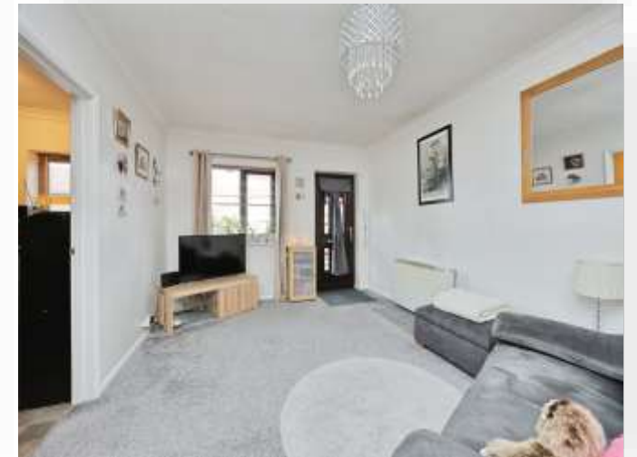
Chapel Street Flats Chapel Street, Shipdham THETFORD IP25 7LB