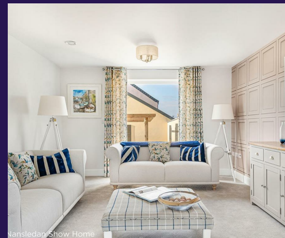
Nansledan Show Home