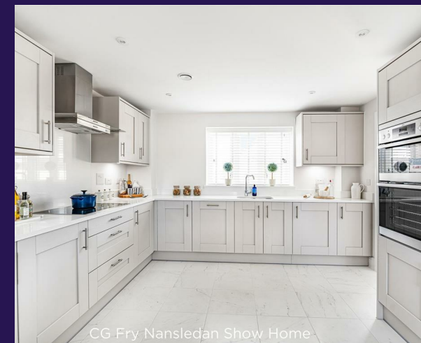
CG Fry Nansledan Show Home