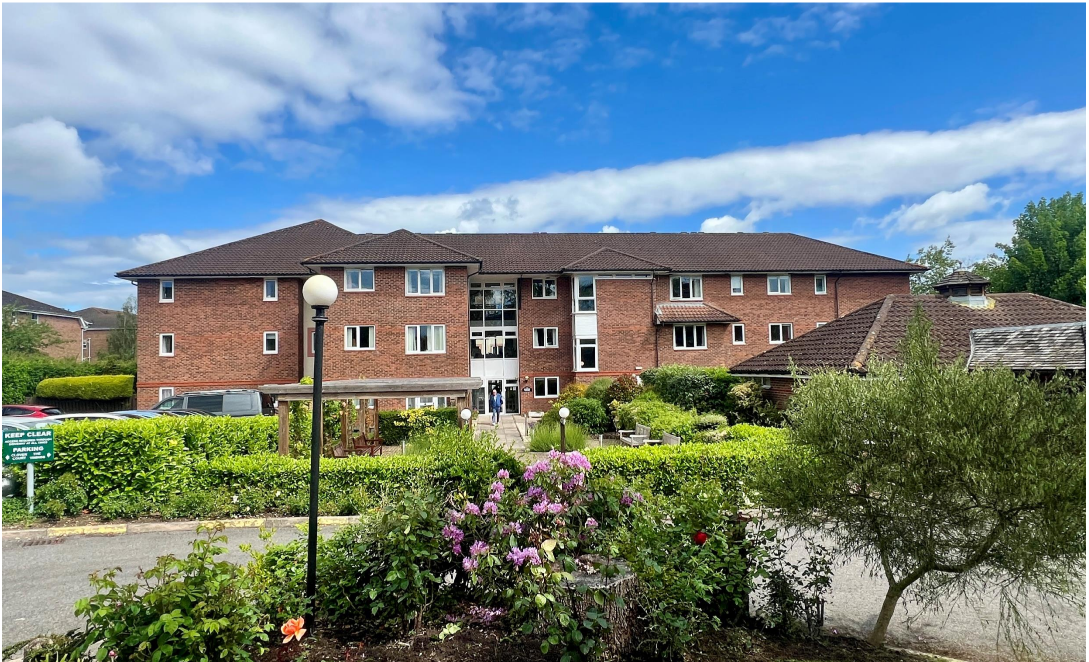
29 Clover Court Church Road, Haywards Heath, RH16 3UF