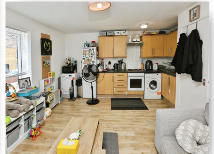
Lansdowne House, Inverness Road, Gosport, PO12 3HL