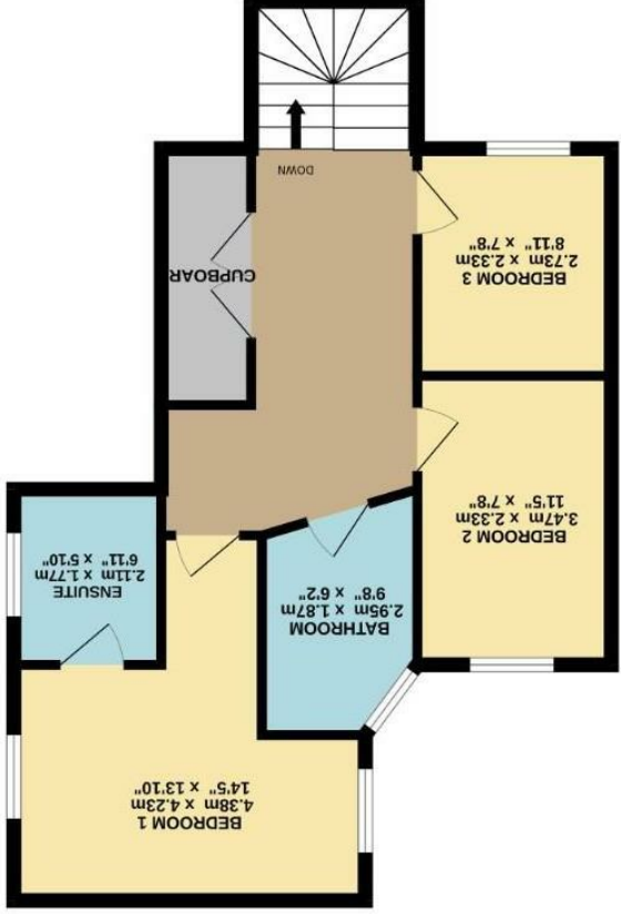
1ST FLOOR (53.0 sq.m. (570 sq.ft.) approx.

12 High Street, Haverhill, Suffolk, CB9 8AR T: 01440 707976 E: haverhill@shiresstateagents.co.uk