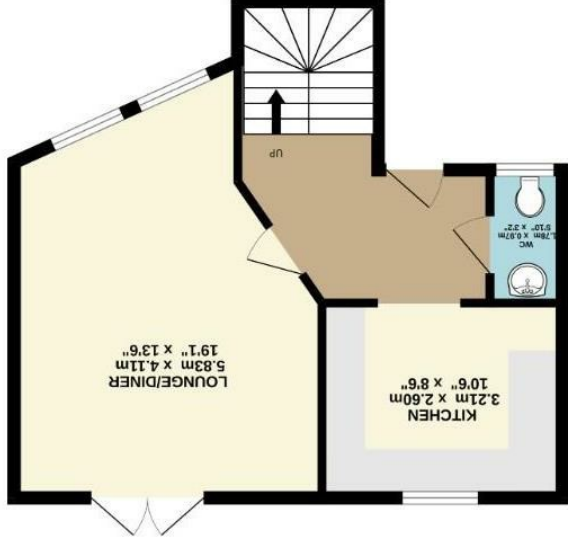
GROUND FLOOR (414 sq.ft.) approx.

TOTAL FLOOR AREA : 91.4 sq.m. (984 sq.ft.) approx.