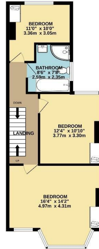
1ST FLOOR 568 sq.ft. (52.7 sq.m.) approx.