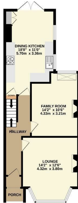
GROUND FLOOR 587 sq.ft. (54.5 sq.m.) approx.