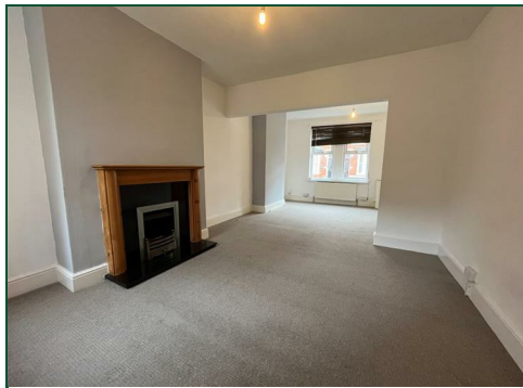
GROUND FLOOR 392 sq.ft. (36.4 sq.m.) approx.