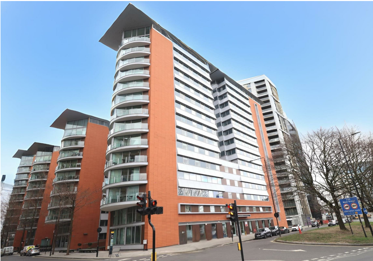
3 Hermitage Street, London, W2 1PB

Nestled in the heart of London, an opportunity to acquire a modern two-bedroom, two-bathroom flat in a purpose-built block. This delightful apartment boasts a spacious reception room, perfect for entertaining guests or enjoying a quiet evening in. The well-appointed open plan kitchen complements the living space, providing both functionality and style.