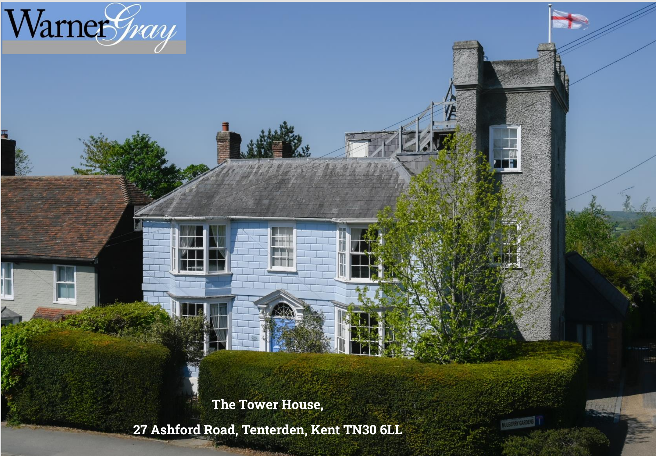
The Tower House, 27 Ashford Road, Tenterden, Kent TN30 6LL