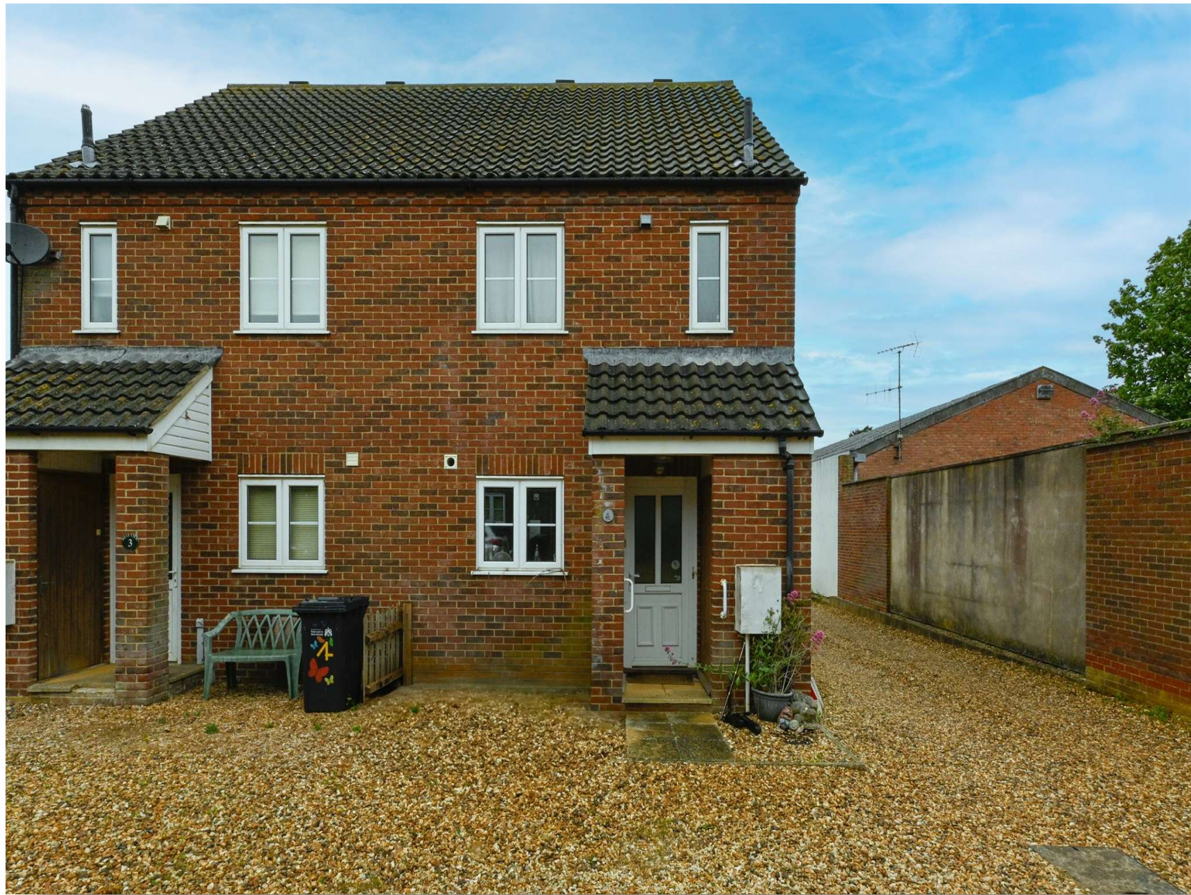
George Raines Close, Hunstanton, PE36 5BJ