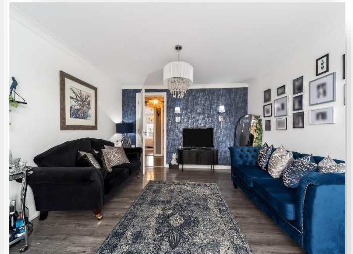
Castlemilk Road, Glasgow G44 4LE