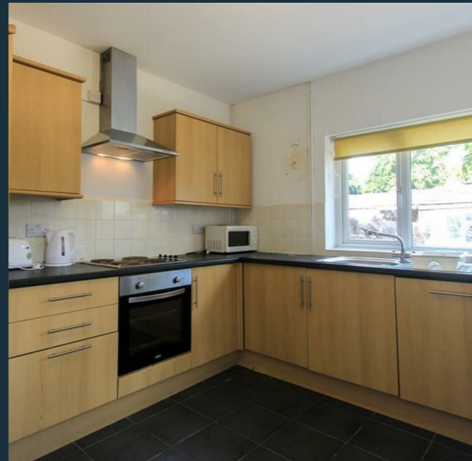
Malefant Street, Cathays.