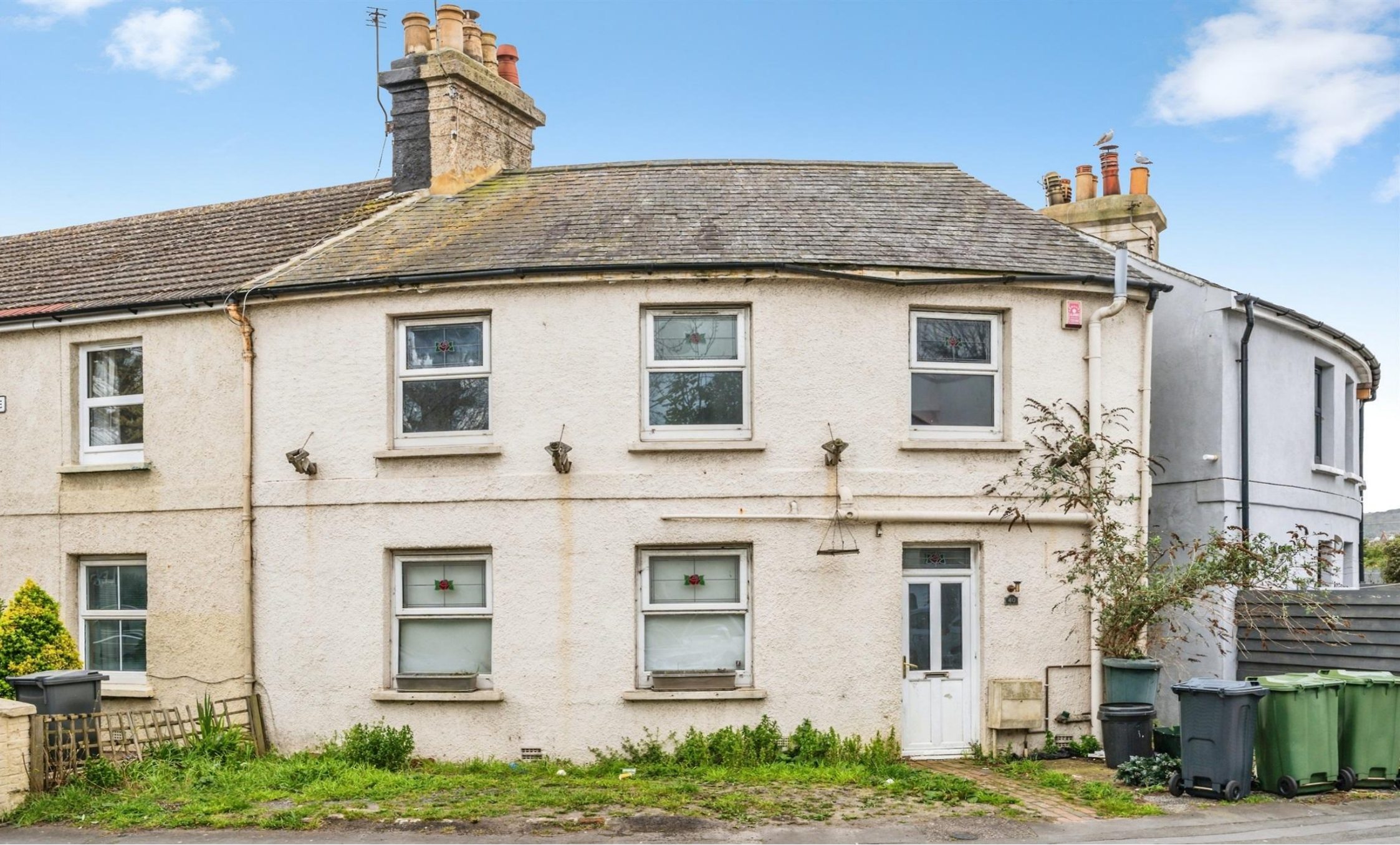
Ashford Square, Eastbourne BN21 3TX