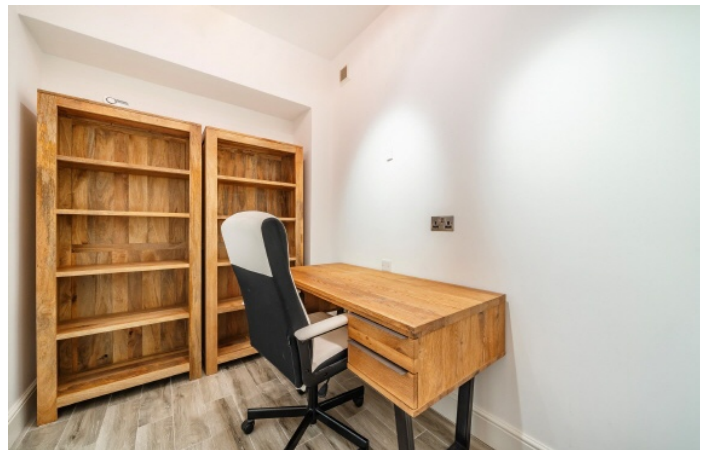
Palace Court, W2