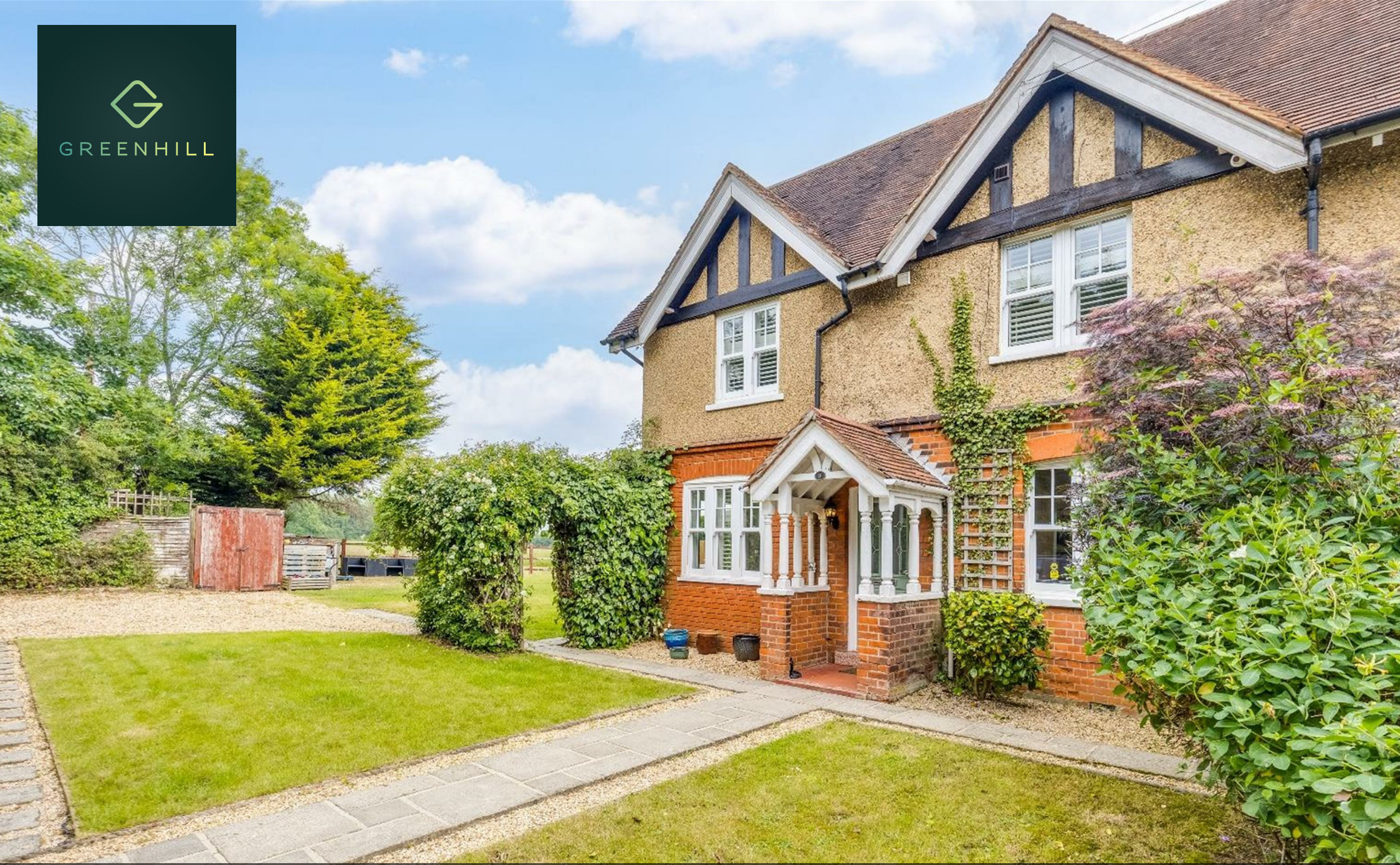
8 Home Farm Cottages Ponsbourne Park Newgate Street, Hertford, SG13 8QT