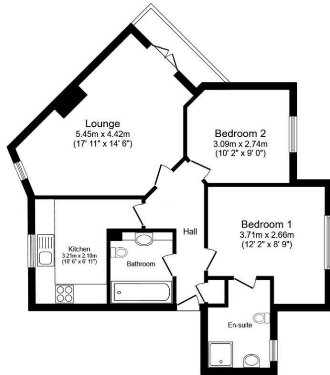
Second Floor Floor area 61.3 sq.m. (660 sq.ft.)

Total floor area: 61.3 sq.m. (660 sq.ft.)