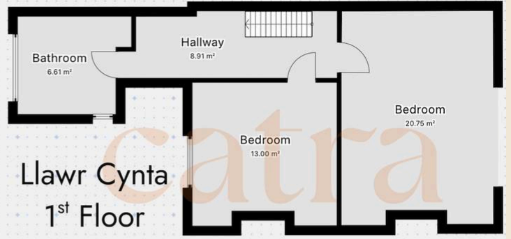
Llawr Cynta 1 st Floor