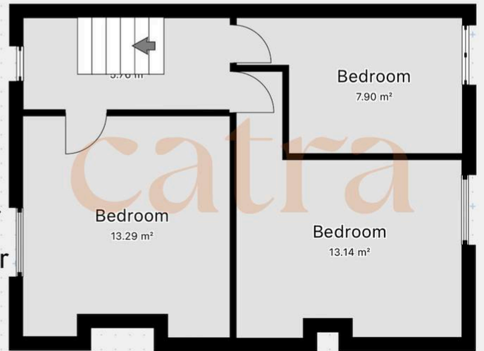
Ail lawr 2 nd Floor