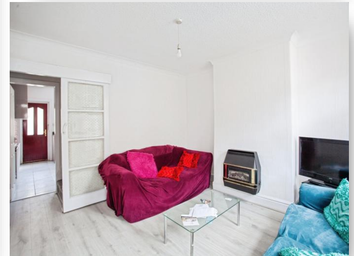
Bramwell Street, Eastwood Rotherham S65 1RZ