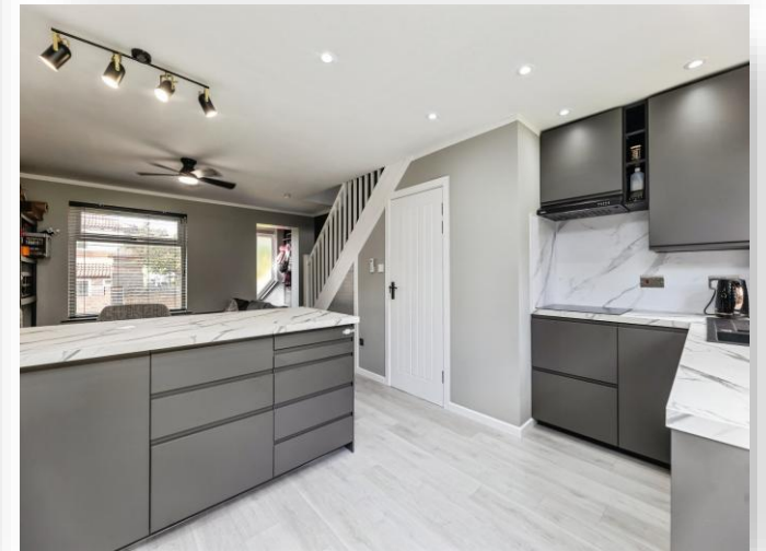
Gorse Lea, Leeds LS10 3XE