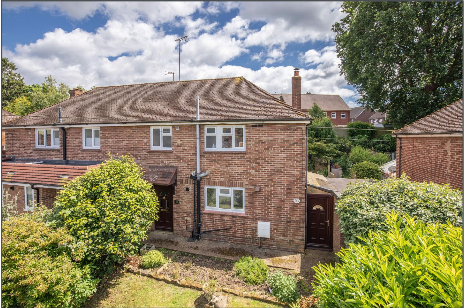
Manor Way, Uckfield, TN22 1DF