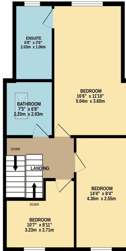
1ST FLOOR 578 sq.ft. (53.7 sq.m.) approx.