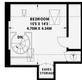
Second Floor 280 sq ft / 26.0 sq m

APPROXIMATE GROSS INTERNAL AREA (INCLUDING LIMITED USE AREA / EAVES STORAGE) 708 sq ft / 65.8 sq m