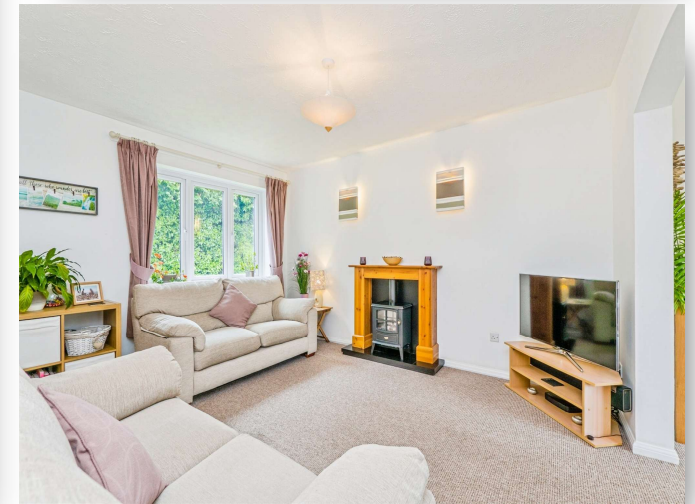
Handley Road, Pengam Green Cardiff CF24 2HF