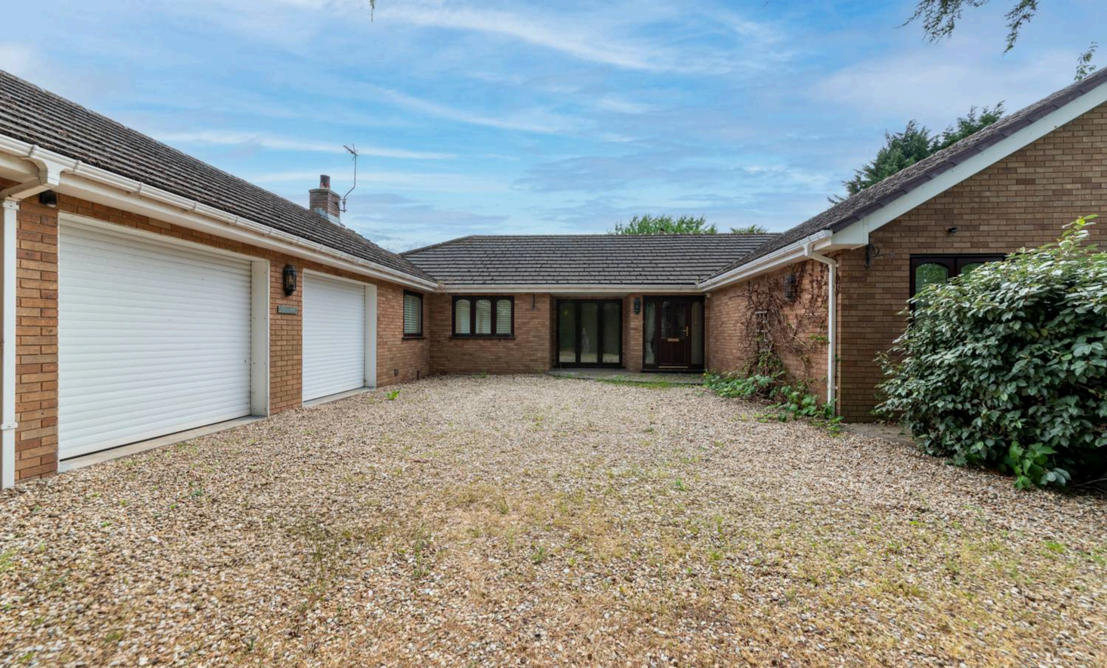
44 Lower Aston Hall Lane, Hawarden £650,000