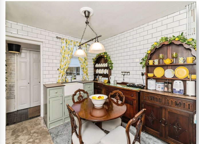
Church Road, Kessingland Lowestoft NR33 7SF