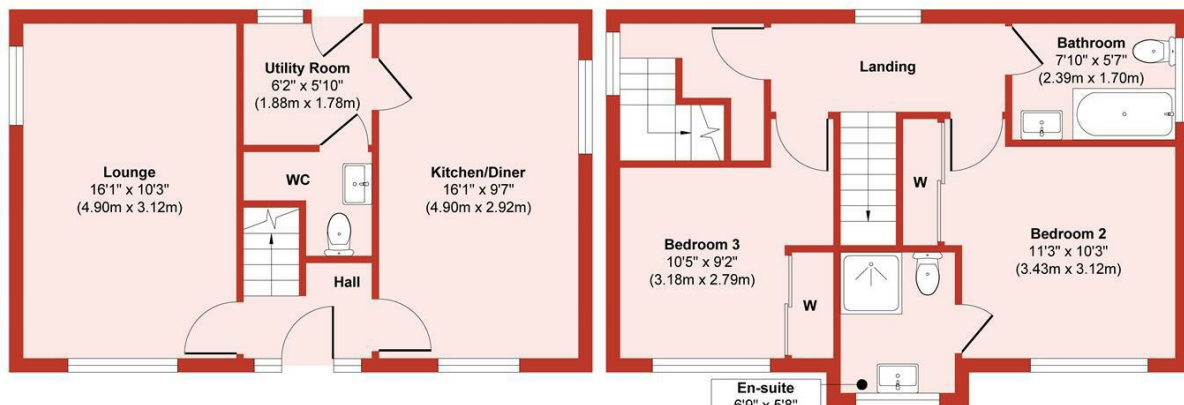
Ground Floor Approximate Floor Area 428 sq. ft (39.76 sq. m)