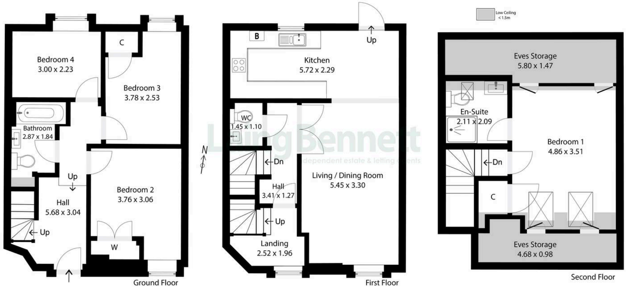
Illustration for identification purposes only. Measurements are approximate. Dimensions given are between the widest points. Not to scale. Outbuildings are not shown in actual location.

Approximate Gross Internal Area = 133 sq m / 1432 sq ft