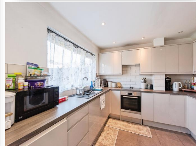
Birch Walk, Raf Lakenheath IP27 9RA