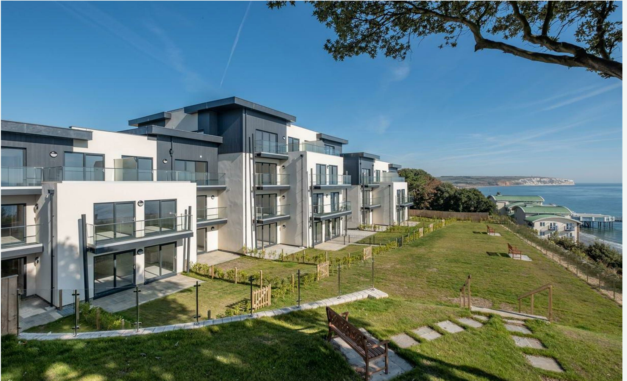
17 Royal Cliff Apartments, First Floor, Grange Road, Sandown, Isle of Wight, PO36 8FB