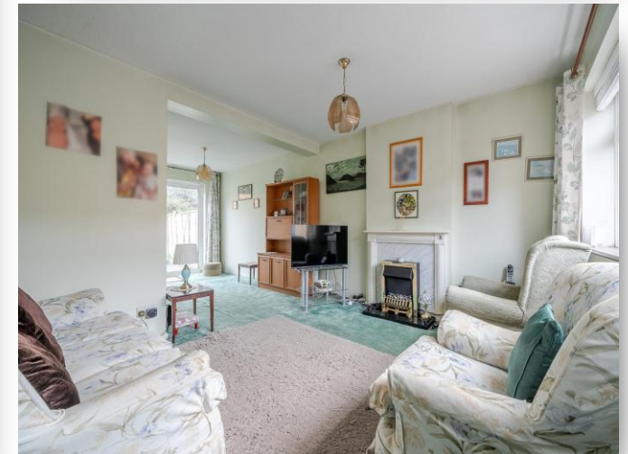
6 Beaumont Close, Maidenhead SL6 3XN