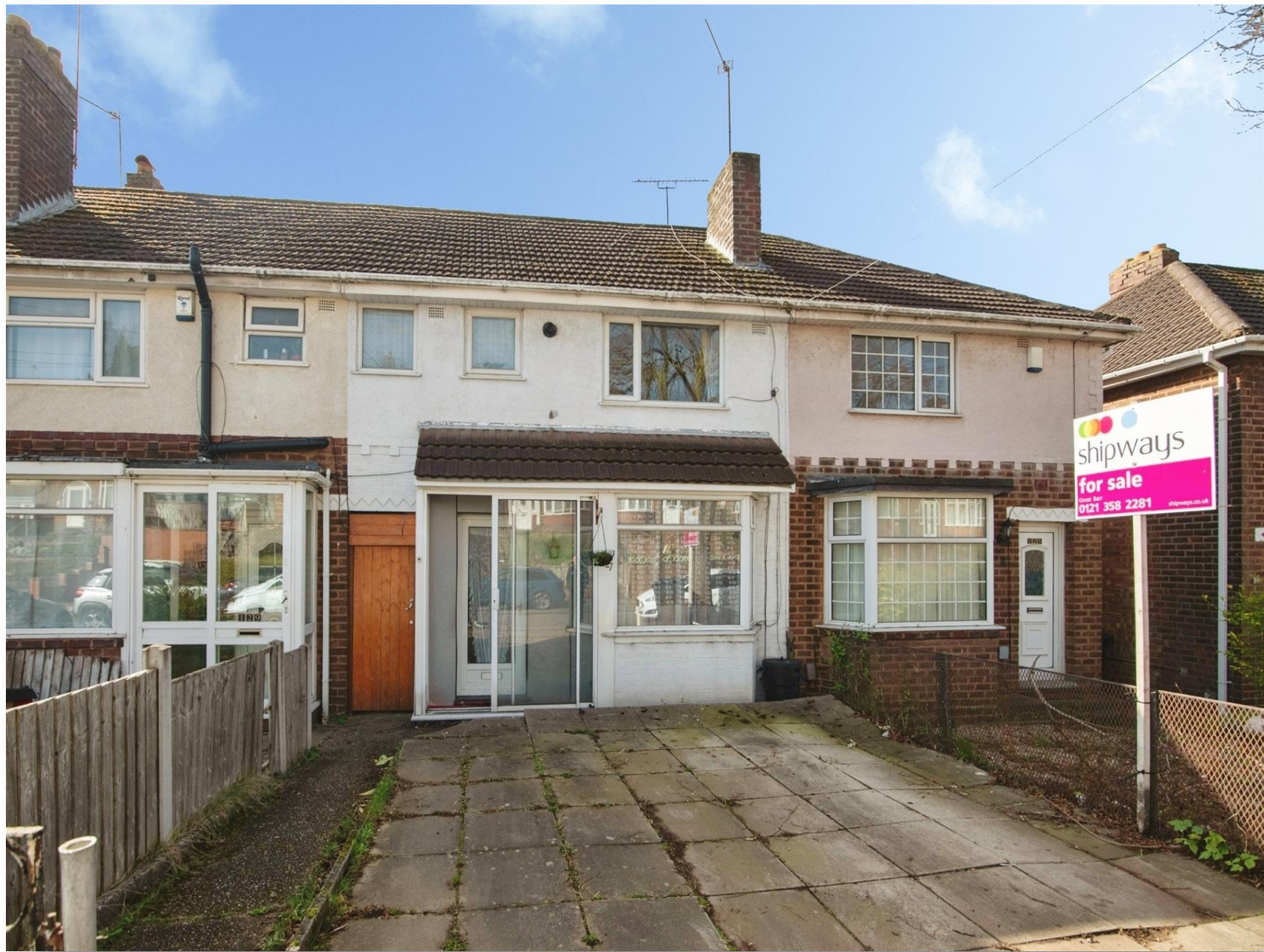
Dorrington Road, BIRMINGHAM B42 1QR