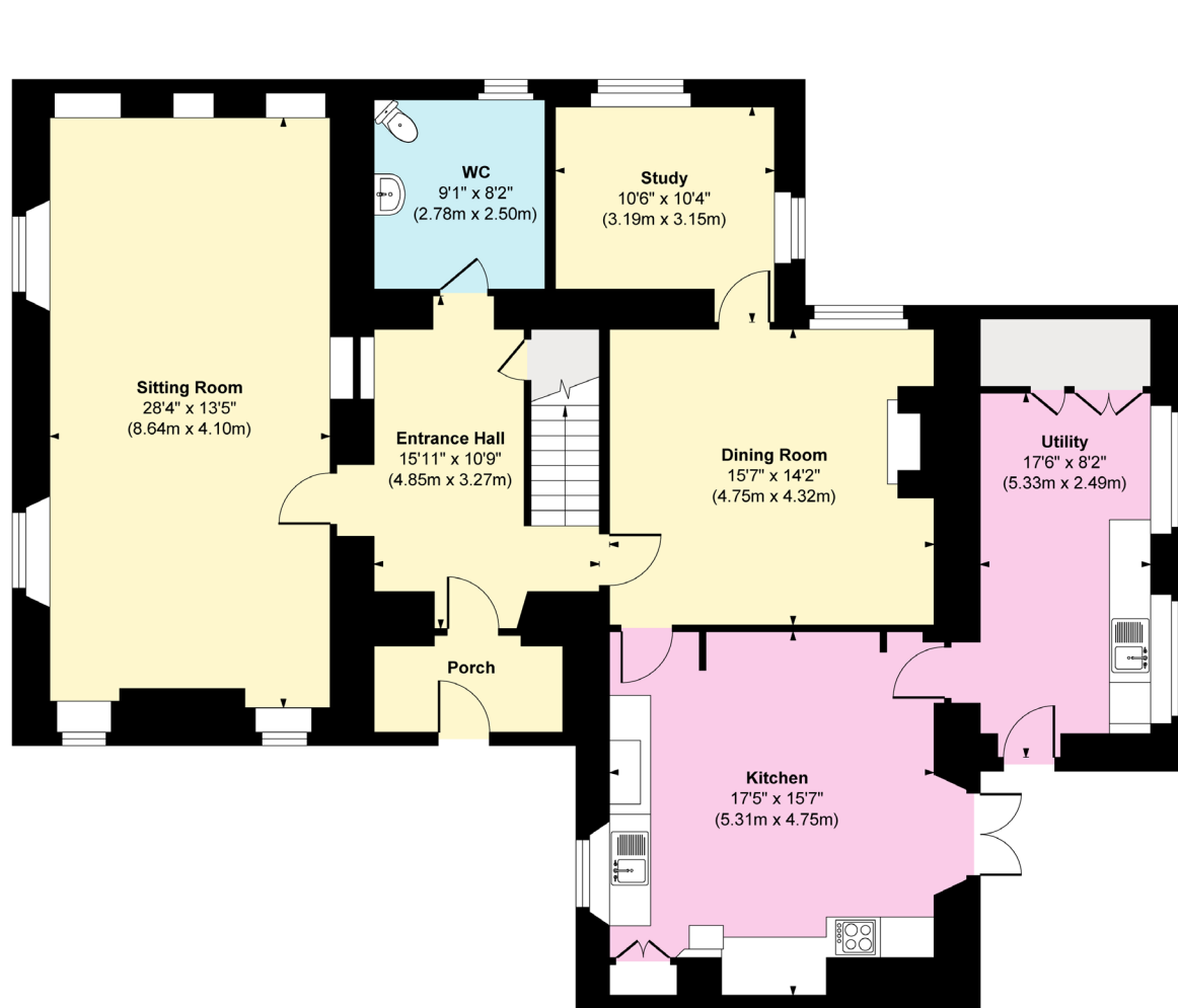
Ground Floor Approximate Floor Area 1584 sq. ft (147.12 sq. m)