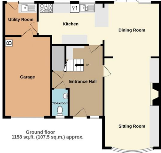
Ground floor 1158 sq.ft. (107.5 sq.m.) approx.

Whilst every attempt has been made to ensure the accuracy of the floorplan contained here, measurements of doors, windows, rooms and any other items are approximate and no responsibility is taken for any error, omission or mis-statement. This plan is for illustrative purposes only and should be used as such by any prospective purchaser. The services, systems and appliances shown have not been tested and no guarantee as to their operability or efficiency can be given. Made with Metropix ©2026