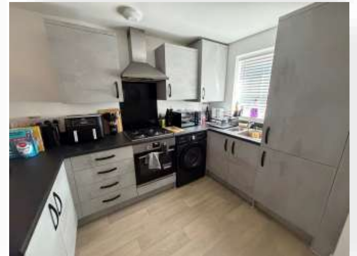
Madingley Drive, Hampton Woods Peterborough PE7 8UY