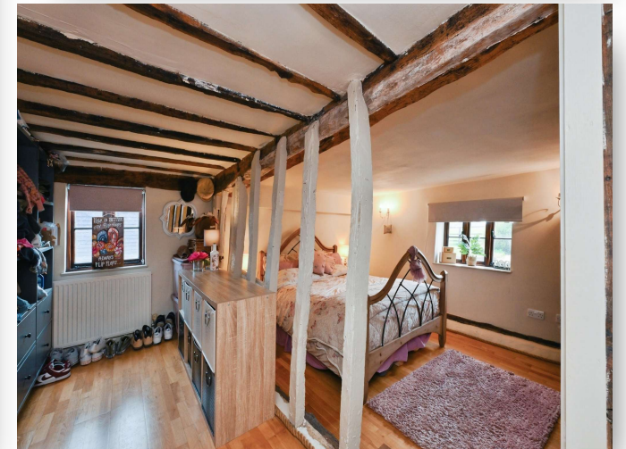
The Farmhouse Crabs Lane, Stocking Pelham Buntingford SG9 OJB