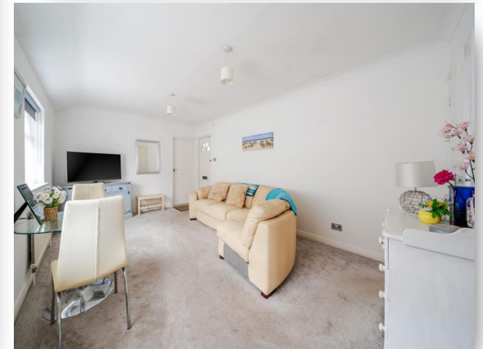
Flat 9 Flint Lodge, Ray Park Road, Maidenhead SL6 8QR