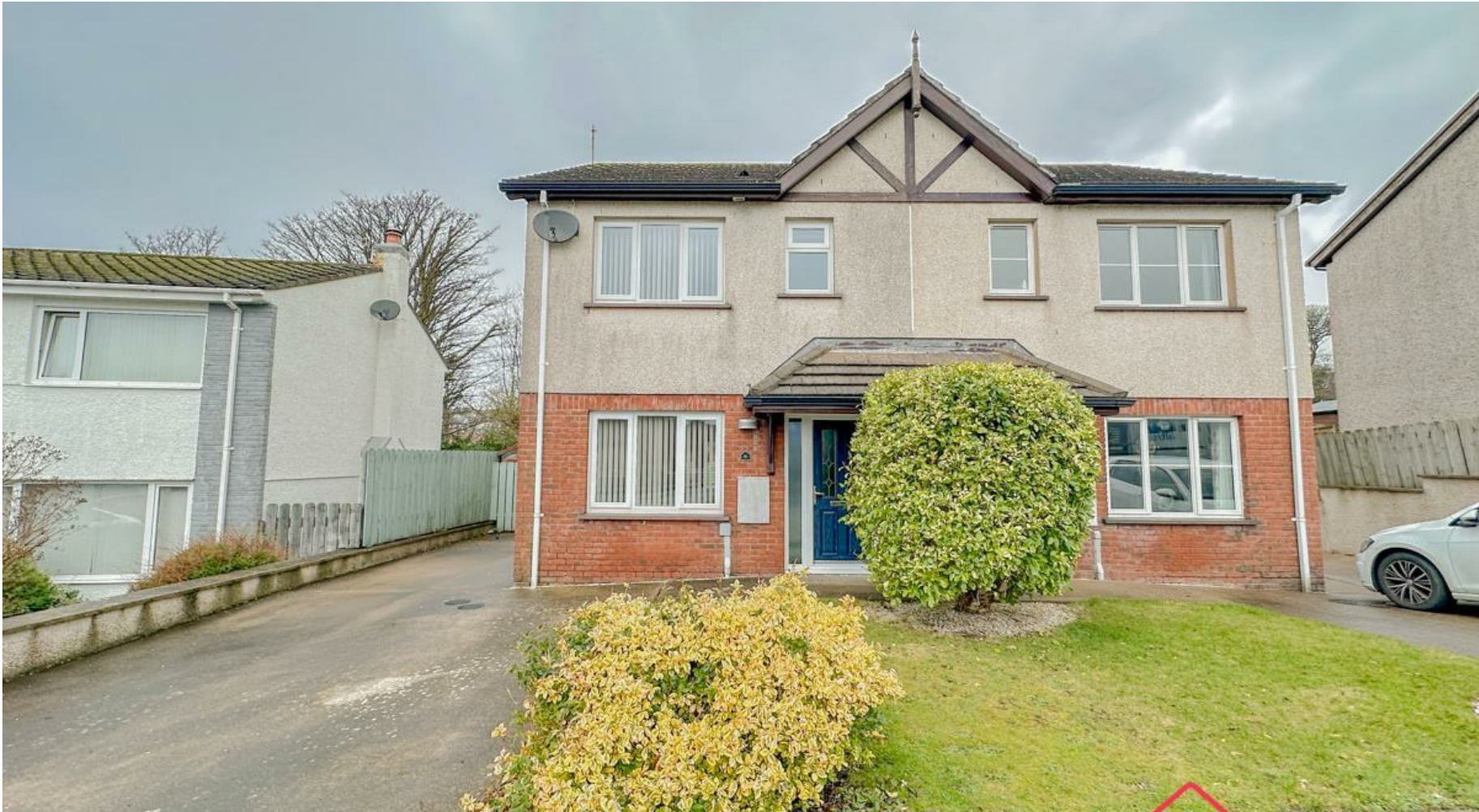
6 Furman Close, Onchan, Isle Of Man, IM3 1BT Asking Price £369,950