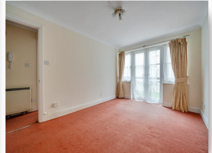
6 Alston Gardens, Maidenhead SL6 6DY