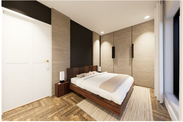
Kinsman Mews Location

Externally, the apartment comes with an allocated parking space including an EV charger. Situated on a private road, residents also benefit from ample unrestricted street parking for guests or second vehicles. The property is offered with a 999-year lease, no ground rent, and low service charges, all backed by a 10-year structural warranty for total peace of mind.