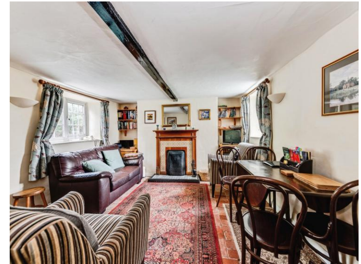
Westover Cottage, Gozzards Ford, Abingdon, OX13 6JH