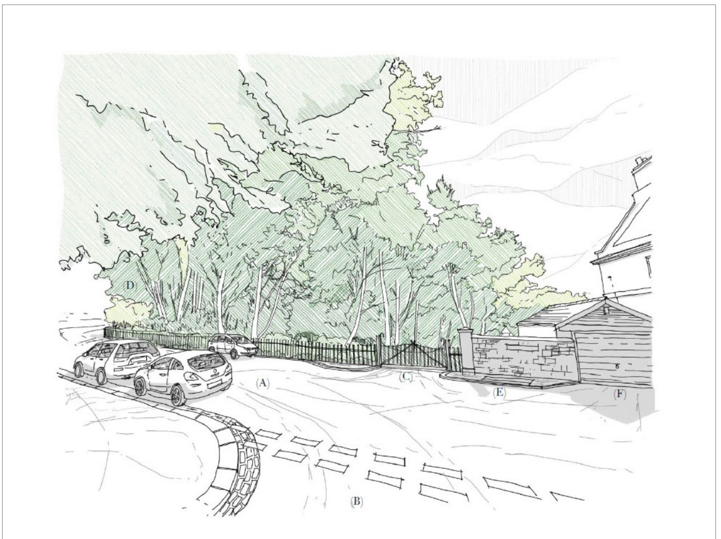
Sketch Illustration: Roadside view from Collingwood Rd facing the site entrance