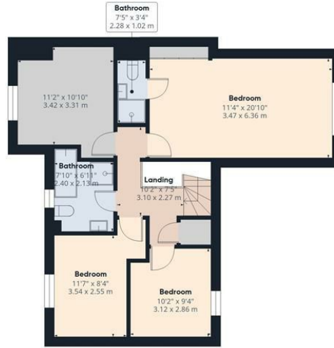
First Floor Building 1