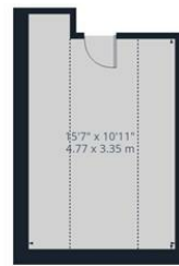
First Floor Building 2