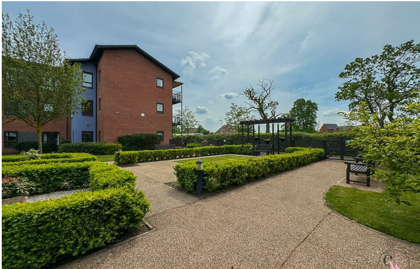
Hazelmere, Hambleton Way, Winsford CW7 1TN