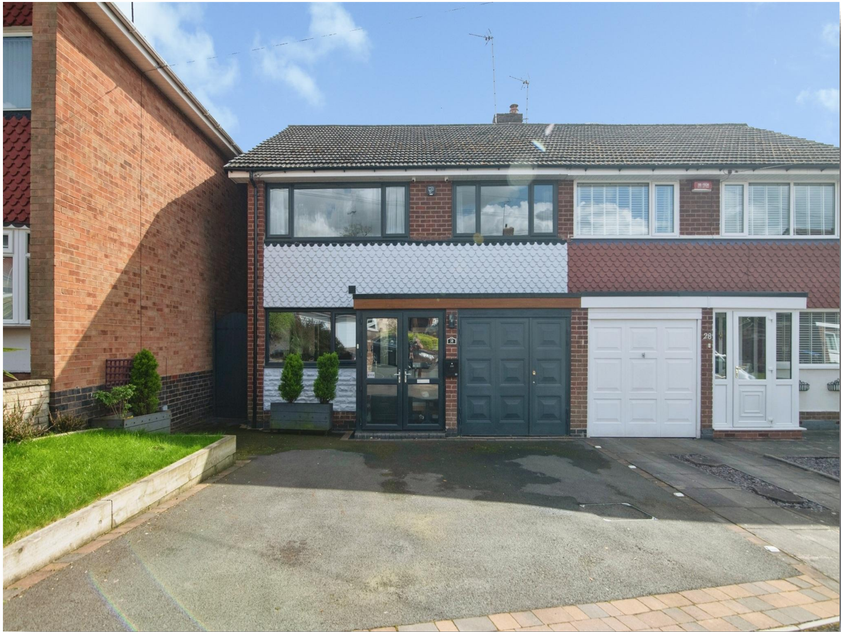
Heather Road, Great Barr BIRMINGHAM B43 5BY