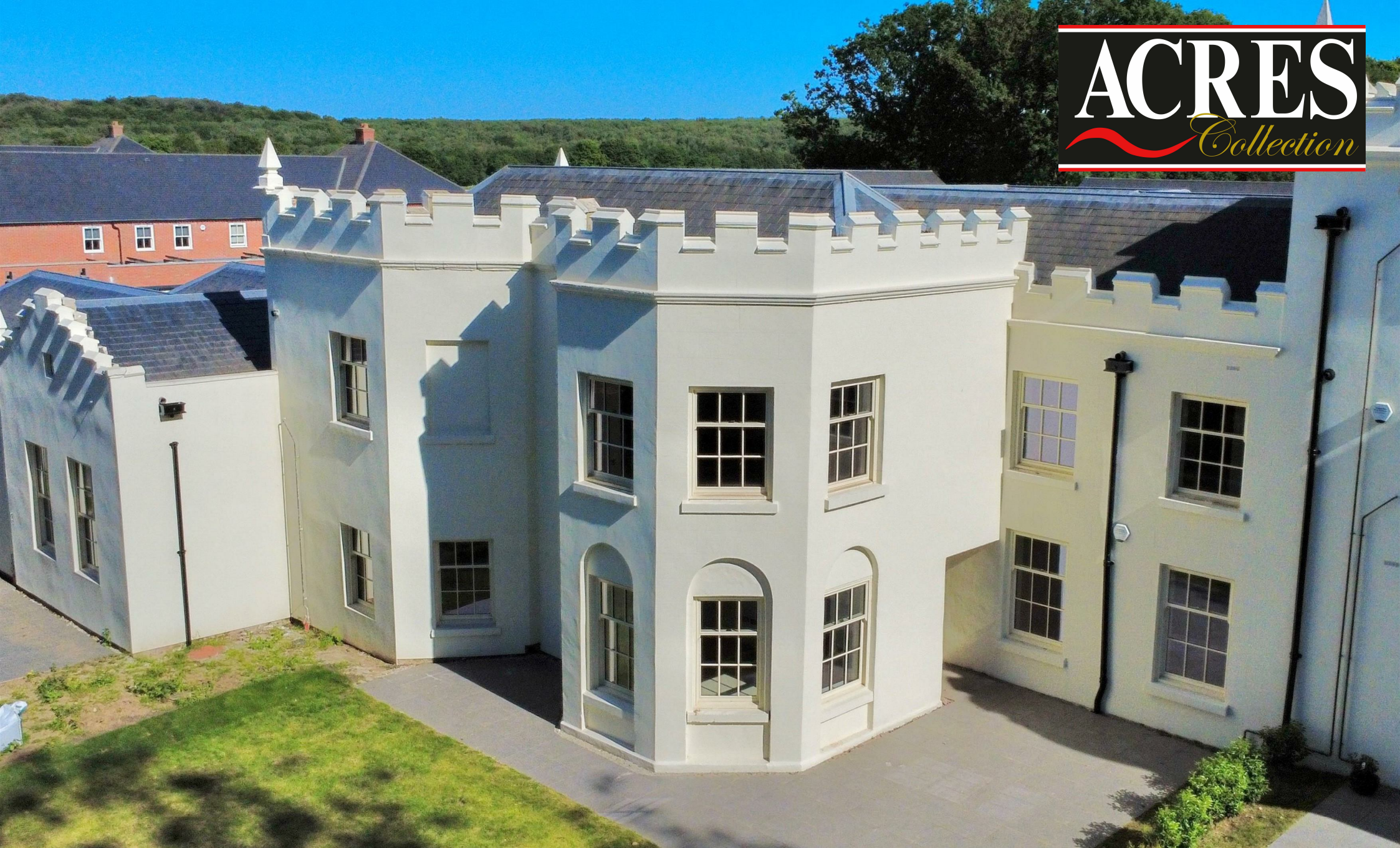
PACKINGTON HALL/MEWS, PACKINGTON, WS14 9HJ £625,000