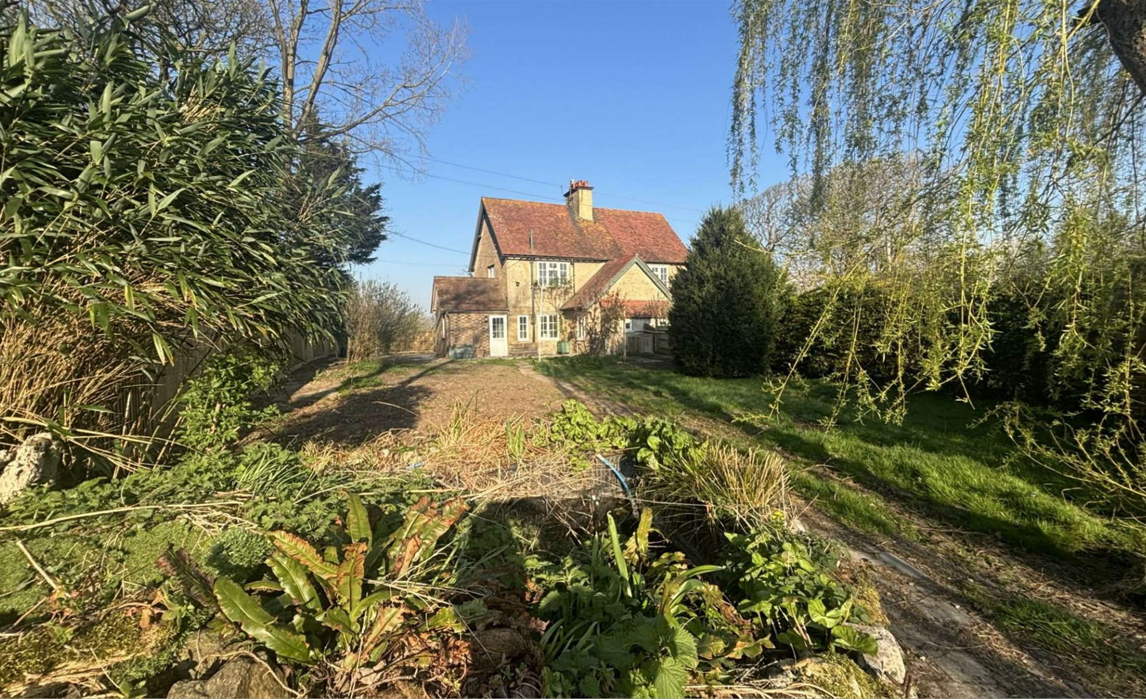
2 New House Cottages, Beddingham, Nr Lewes, East Sussex, BN8 6JX